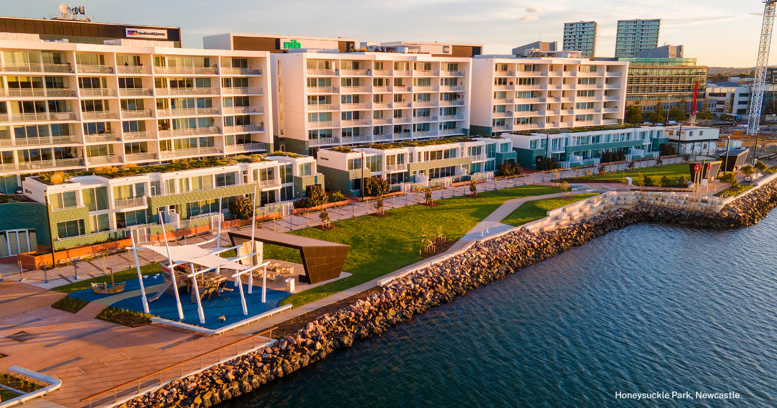
Honeysuckle Park, Newcastle

Hunter and Central Coast Development Corporation