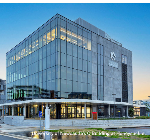
University of Newcastle's Q Building at Honeysuckle