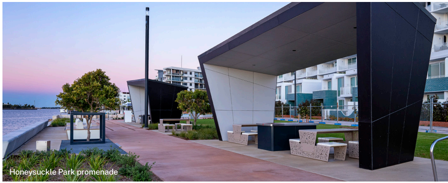
Honeysuckle Park promenade